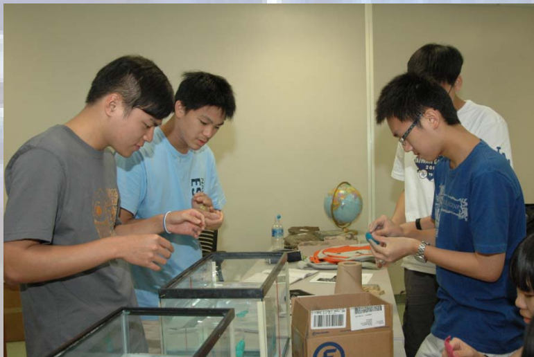
模擬製作 plankton 做浮力測試